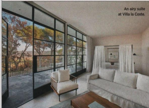
An airy suite at Villa la Coste.

your visit by exploring the area's creative food scene. For dinner, try the seven-day dry-aged duck breast at the new Foxcroft ( foxcroft.co.za ), launched by chef Scot Kirton of the hilltop La Colombe (where the tasting menu is as impressive as the glittering city below). Vintages from the surrounding Winelands are on offer at both. Should you venture out that way, make Babel ( babylonstoren.com )—at the nexus of Stellenbosch, Franschhoek and Paarl—your destination. Ingredients are grown on-site, and items like the playful "yellow" plate, with pineapple, roasted quince and turmeric vinaigrette, are spirit-lifting. —BREE SPOSATO