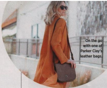
On the go with one of Parker Clay's leather bags.