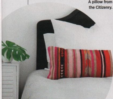
A pillow from the Citizenry.