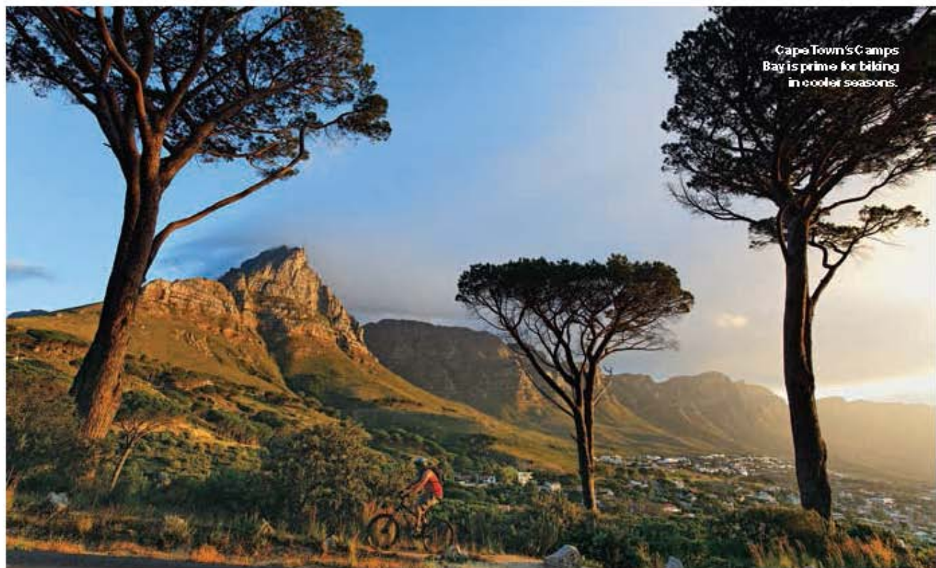
Cape Town's Camps Bay is prime for biking in cooler seasons.