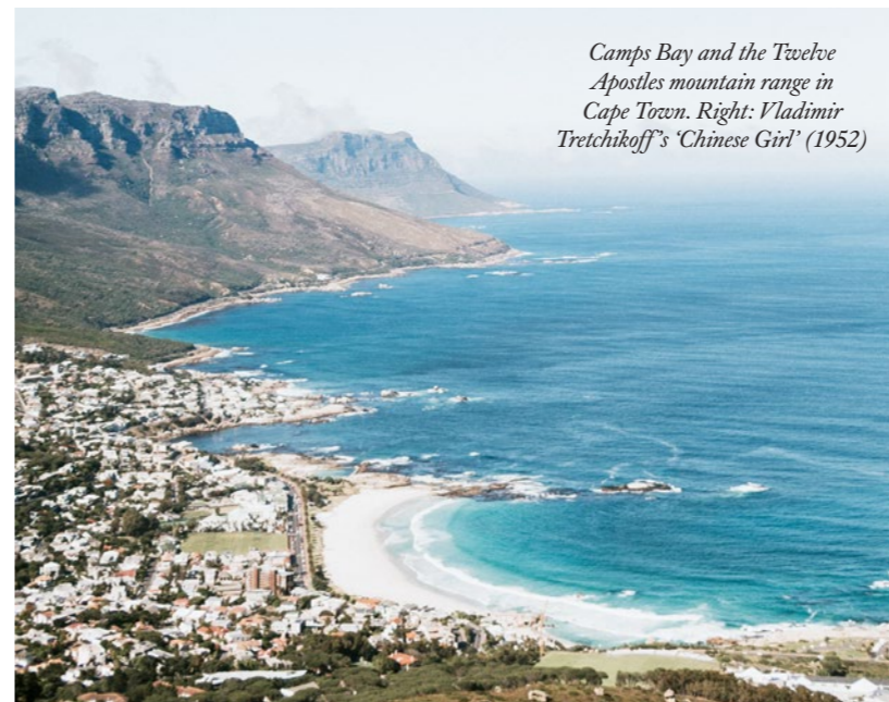
Camps Bay and the Twelve Apostles mountain range in Cape Town. Right: Vladimir Tretchikoff's 'Chinese Girl' (1952)

Just minutes away is Majeka House, the boutique hotel that was my base for the trip. Built in the owners' former family home after they moved next-door, it is as quirky as it is luxurious, with vivid wallpaper, bold artwork and a cosy library piled high with board games. It also houses an award-winning restaurant, Makaron, where the tasting menu, paired with outstanding local wines, was easily one of the best meals I've ever eaten, and included baby marrow risotto with cured egg-yolk shavings, a butter-poached kingklip with black garlic and an ice-cream sandwich to finish.